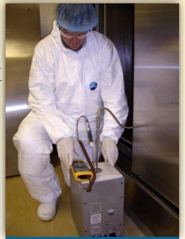
A Honeyman Engineer calibrating a client temperature probe

Our team of leading industry experts have assisted our clients on projects during all life cycle phases from initial start-up and qualification, through production optimisation and supported them during investigation and remediation activities.